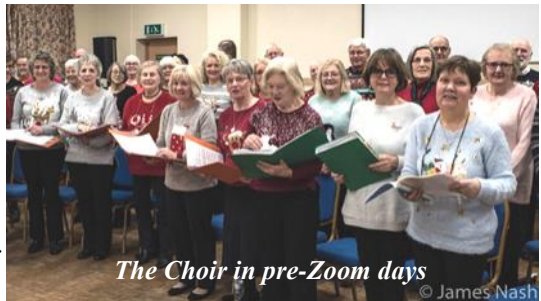
The Choir in pre-Zoom days

When lockdown began in March, the Woottons Community Choir, a thriving group of nearly 50 local people of all ages, decided they would not be defeated! They have been as busy as ever, practising their songs at home with the help of specially adapted audio files, and connecting each Tuesday evening at 7pm via Zoom.